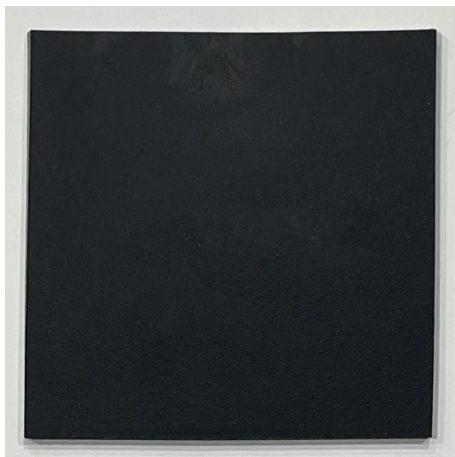
＜ Seiwa Antibacterial Elastomer Sheet-BLACK ＞

[remainder of page intentionally left blank]